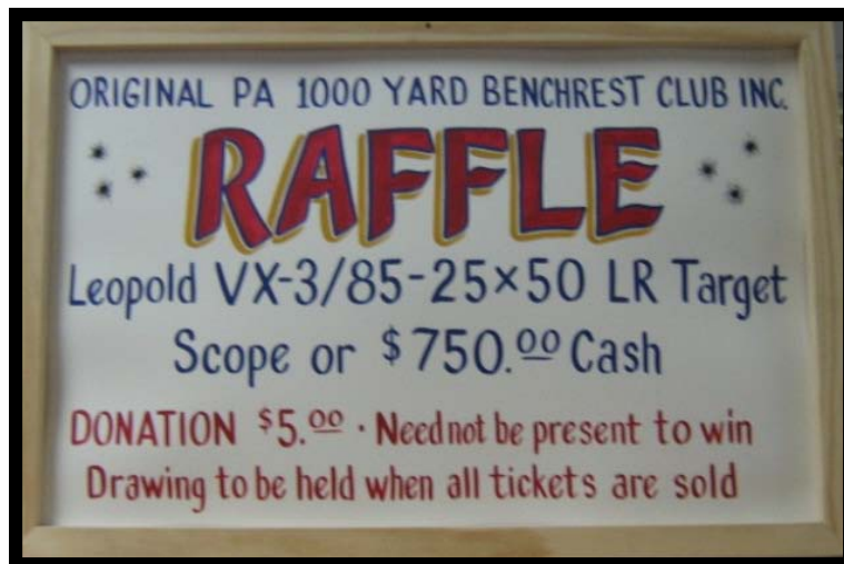
Tickets available at the Club House